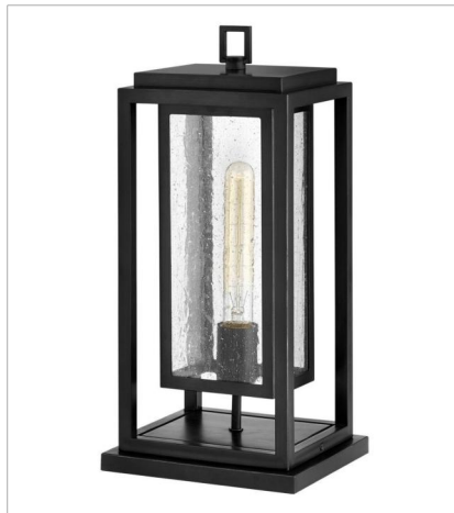
1007BK MEDIUM PIER MOUNT LANTERN 7" W, 16.5" H LED Lamp 1-12w Med. LED, 100w Equiv.