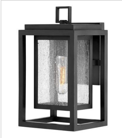
1000BK SMALL WALL MOUNT LANTERN 7" W, 12" H LED Lamp 1-12w Med. LED, 100w Equiv.