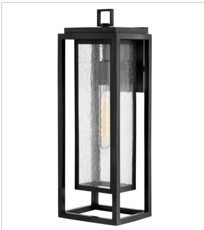
1005BK LARGE OUTDOOR WALL MOUNT LA... 7" W, 20" H LED Lamp 1-12w Med. LED, 100w Equiv.