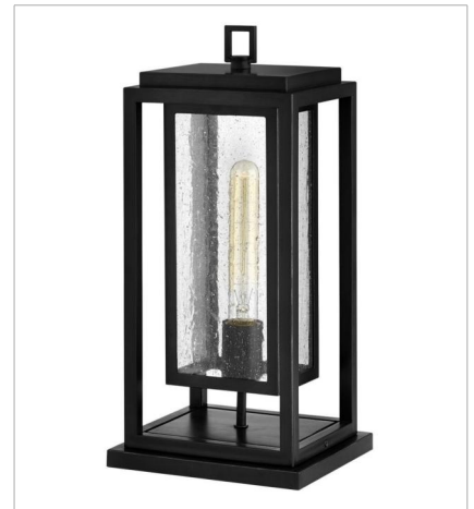
1007BK-LV MEDIUM PIER MOUNT LANTERN 12V 7" W, 16.5" H LED Lamp 1-3.50w Med. LED *Included