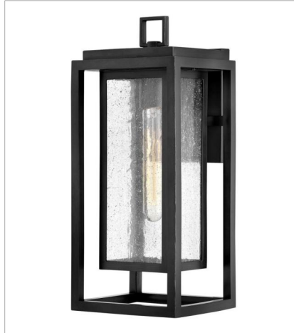
1004BK MEDIUM WALL MOUNT LANTERN 7" W, 16" H LED Lamp 1-12w Med. LED, 100w Equiv.