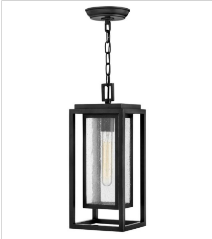
1002BK MEDIUM HANGING LANTERN 7" W, 16.8" H LED Lamp 1-12w Med. LED, 100w Equiv.