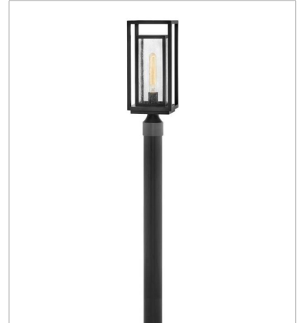
1001BK MEDIUM POST TOP OR PIER MOUNTING 7" W, 17" H LED Lamp 1-12w Med. LED, 100w Equiv.