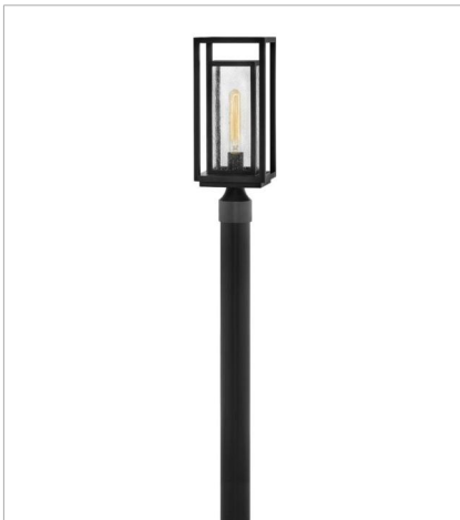
1001BK-LV MEDIUM POST TOP OR PIER MOUNTING 7" W, 17" H LED Lamp 1-3.50w Med. LED *Included