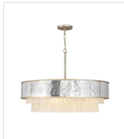
FR32708CPG LARGE DRUM 36" W, 26" H Socketed 8-5w Cand. LED, 60w Equiv.