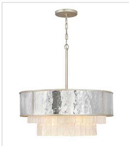
FR32706CPG MEDIUM DRUM 26" W, 26" H Socketed 8-5w Cand. LED, 60w Equiv.