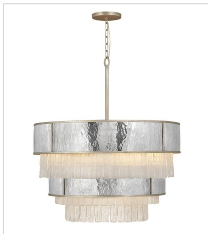
FR32705CPG MEDIUM MULTI TIER CHANDELIER 32" W, 35.3" H Socketed 12-5w Cand. LED, 60w Equiv.

FINISH: Champagne Gold SHADE: Hammered Stainless Steel