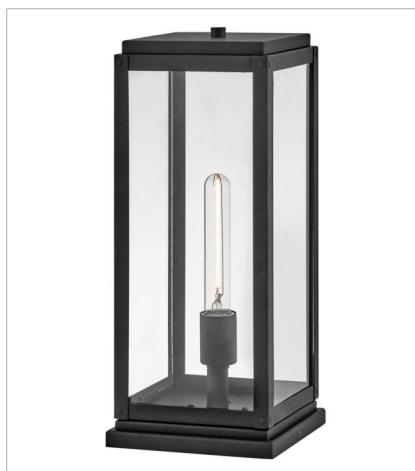
28857BK-LV MEDIUM PIER MOUNT LANTERN 7.3" W, 17" H Socketed 1-8w Med. LED *Included