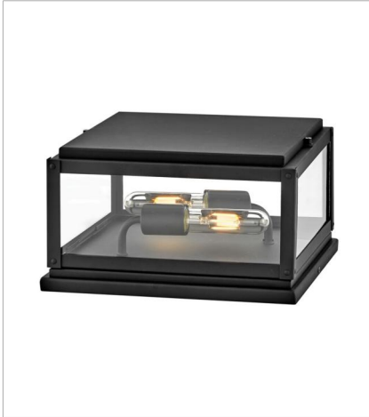
28858BK-LV SMALL PIER MOUNT LANTERN 12" W, 7.5" H Socketed 2-8w Med. LED *Included

FINISH: Black GLASS: Clear, Clear and Etched White (optional)