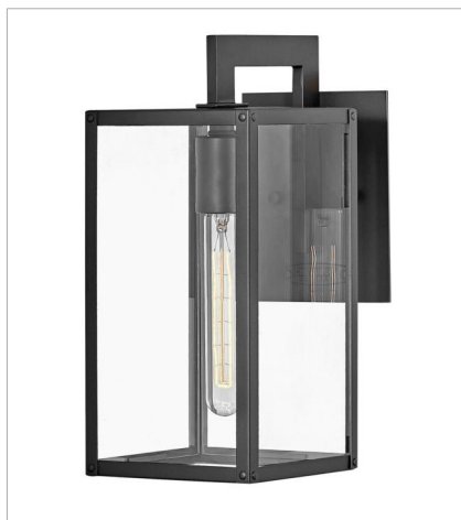
2590BK SMALL WALL MOUNT LANTERN 6" W, 13.3" H Socketed 1-12w Med. LED, 100w Equiv.

FINISH: Black GLASS: Clear, Clear and Etched White (optional)