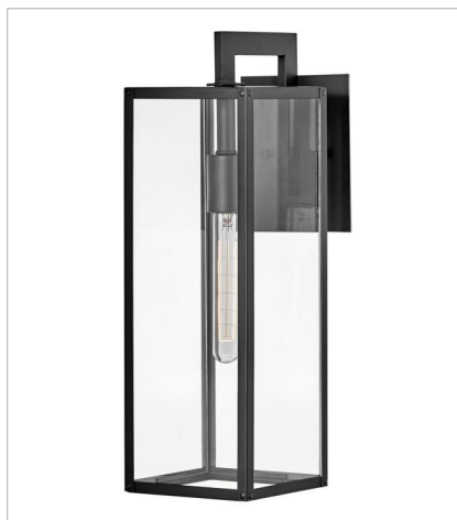
2594BK MEDIUM WALL MOUNT LANTERN 6" W, 18.5" H Socketed 1-12w Med. LED, 100w Equiv.