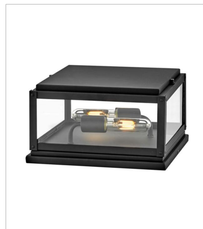
28858BK SMALL PIER MOUNT LANTERN 12" W, 7.5" H Socketed 2-8w Med. LED, 60w Equiv.