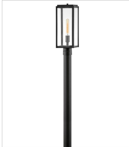
2591BK MEDIUM POST TOP OR PIER MOUNT... 7" W, 18.5" H Socketed 1-12w Med. LED, 100w Equiv.