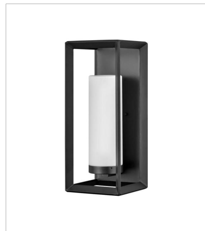
29309BGR LARGE WALL SCONCE 9" W, 22" H Socketed 1-10w Med. LED, 100w Equiv.