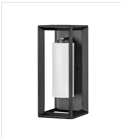
29302BGR MEDIUM WALL SCONCE 7" W, 16.8" H Socketed 1-10w Med. LED, 100w Equiv.