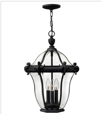
2442MB LARGE HANGING LANTERN 14" W, 20" H Socketed 3-5w Cand. LED, 40w Equiv.