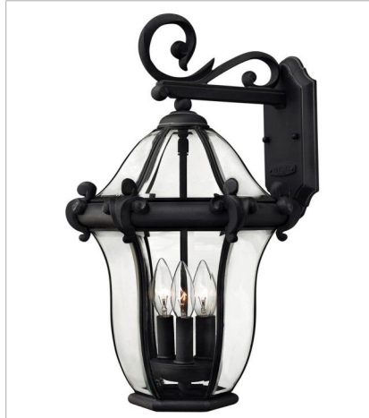
2444MB MEDIUM WALL MOUNT LANTERN 12.3" W, 19.8" H Socketed 3-5w Cand. LED, 40w Equiv.