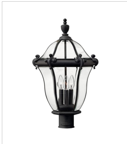
2441MB LARGE POST MOUNT LANTERN 14" W, 22.3" H Socketed 3-5w Cand. LED, 40w Equiv.