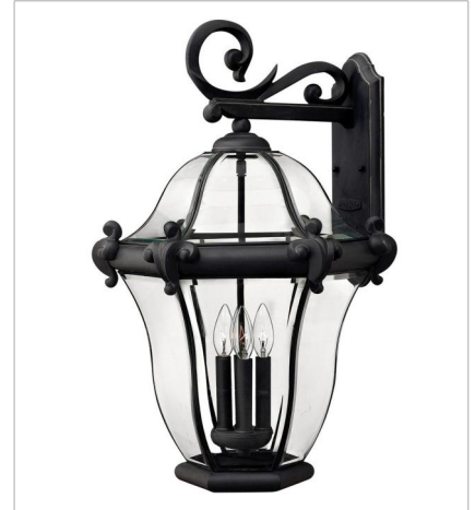
2446MB EXTRA LARGE WALL MOUNT LANTERN 17" W, 25.8" H Socketed 4-5w Cand. LED, 40w Equiv.