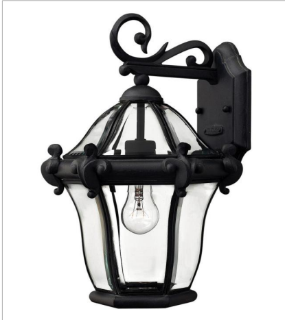
2440MB SMALL WALL MOUNT LANTERN 8.5" W, 13.8" H Socketed 1-10w Med. LED, 60w Equiv.

FINISH: Museum Black GLASS: Clear, Beveled and Bound