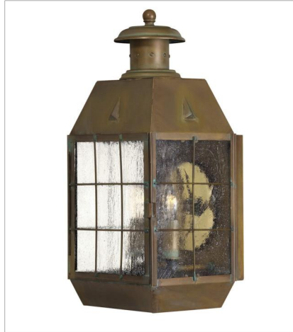
2374AS LARGE WALL MOUNT LANTERN 7.5" W, 16.8" H Socketed 2-5w Cand. LED, 60w Equiv.