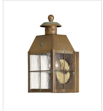
2376AS SMALL WALL MOUNT LANTERN 4.5" W, 9.8" H Socketed 1-12w Med. LED, 100w Equiv.