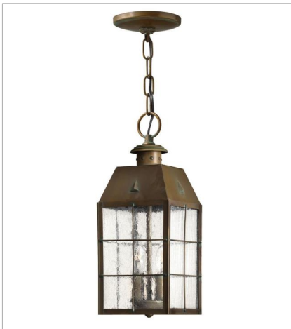
2372AS MEDIUM HANGING LANTERN 5.5" W, 14.5" H Socketed 2-5w Cand. LED, 40w Equiv.