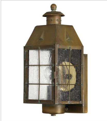
2370AS MEDIUM WALL MOUNT LANTERN 5.5" W, 13.5" H Socketed 1-12w Med. LED, 75w Equiv.