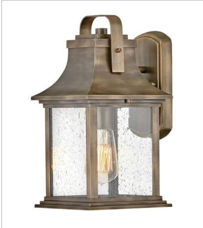
2390BU SMALL WALL MOUNT LANTERN 7.3" W, 13.8" H Socketed 1-12w Med. LED, 100w Equiv.

FINISH: Burnished Bronze GLASS: Clear Seedy