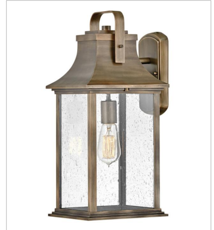
2395BU LARGE WALL MOUNT LANTERN 8.5" W, 19" H Socketed 1-12w Med. LED, 100w Equiv.