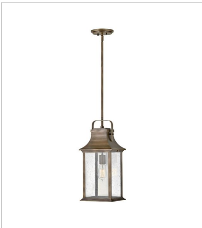
2392BU MEDIUM HANGING LANTERN 8.5" W, 19.8" H Socketed 1-12w Med. LED, 100w Equiv.