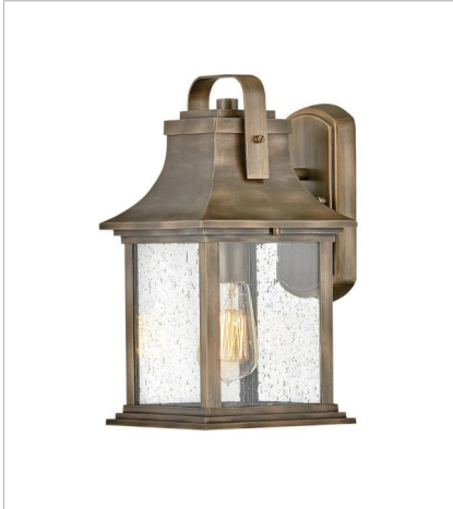
2390BU SMALL WALL MOUNT LANTERN 7.3" W, 13.8" H Socketed 1-12w Med. LED, 100w Equiv.

FINISH: Burnished Bronze GLASS: Clear Seedy