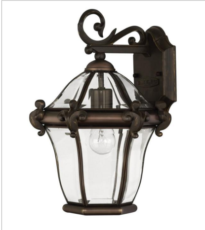
2440CB SMALL WALL MOUNT LANTERN 8.5" W, 13.8" H Socketed 1-10w Med. LED, 60w Equiv.

FINISH: Copper Bronze GLASS: Clear, Beveled and Bound