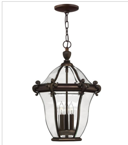
2442CB LARGE HANGING LANTERN 14" W, 20" H Socketed 3-5w Cand. LED, 40w Equiv.