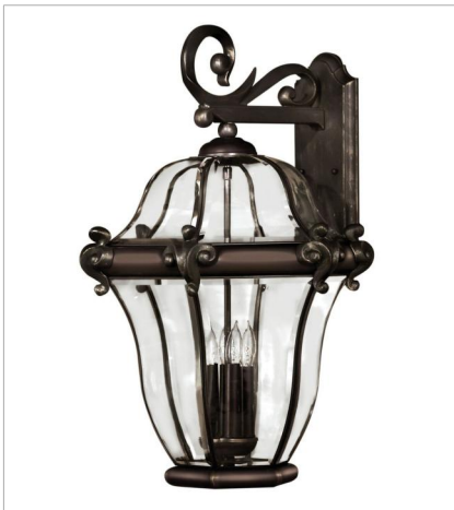
2446CB EXTRA LARGE WALL MOUNT LANTERN 17" W, 25.8" H Socketed 4-5w Cand. LED, 40w Equiv.