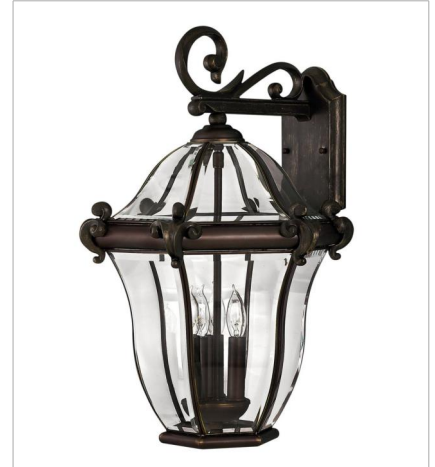
2445CB LARGE WALL MOUNT LANTERN 14" W, 20.8" H Socketed 3-5w Cand. LED, 40w Equiv.