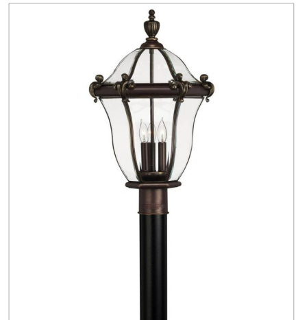
2441CB LARGE POST TOP OR PIER MOUN... 14" W, 22.3" H Socketed 3-5w Cand. LED, 40w Equiv.