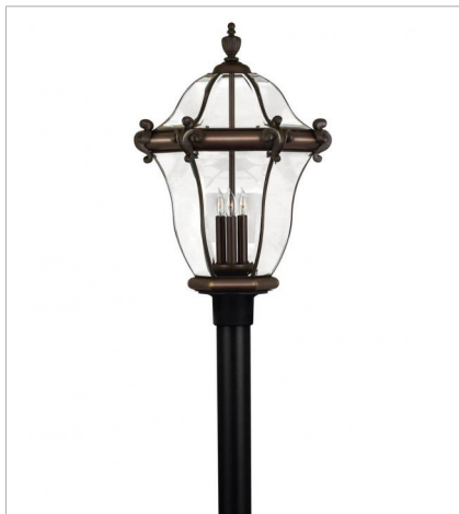
2447CB EXTRA LARGE POST OR PIER MO... 17" W, 26.3" H Socket 3-40w Cand.

FINISH: Copper Bronze GLASS: Clear, Bent, Beveled and Bound