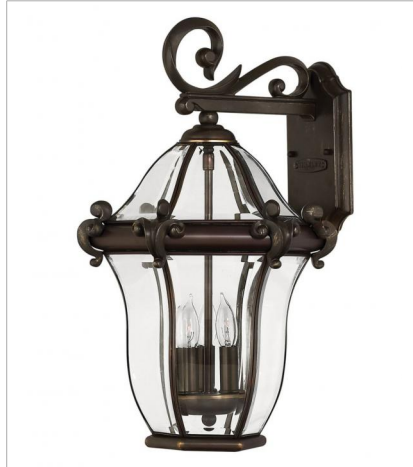
2444CB MEDIUM WALL MOUNT LANTERN 12.3" W, 19.8" H Socket 3-40w Cand.