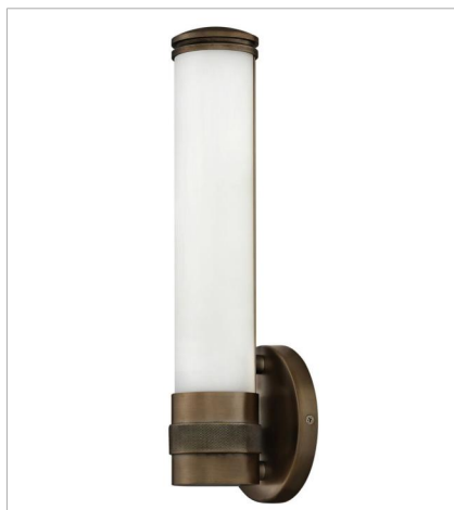
5070CR SMALL LED SCONCE 4.8" W, 14.3" H Integrated LED 17w LED *Included

FINISH: Champagne Bronze GLASS: Etched White