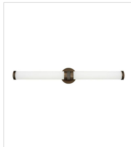
5074CR LARGE LED VANITY 32.8" W, 4.8" H Integrated LED 53w LED *Included