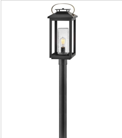
1161BK MEDIUM POST OR PIER MOUNT L... 9.5" W, 23" H Socketed 1-10w Med. LED, 100w Equiv.