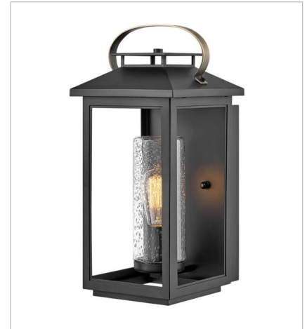
1164BK MEDIUM WALL MOUNT LANTERN 8.3" W, 17.5" H Socketed 1-10w Med. LED, 100w Equiv.