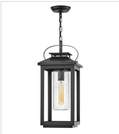
1162BK MEDIUM HANGING LANTERN 9.5" W, 21.5" H Socketed 1-10w Med. LED, 100w Equiv.