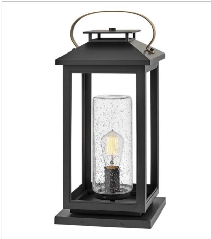
1167BK MEDIUM PIER MOUNT 9.5" W, 21.5" H Socketed 1-10w Med. LED, 100w Equiv.