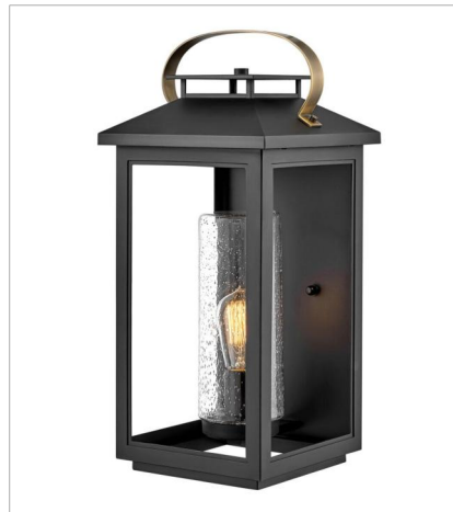
1165BK LARGE OUTDOOR WALL MOUNT LA... 9.5" W, 20.5" H Socketed 1-10w Med. LED, 100w Equiv.