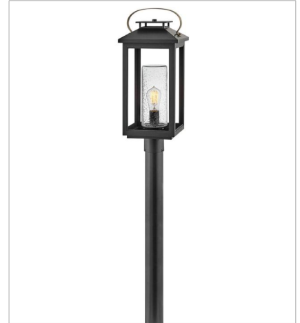
1161BK-LV LARGE POST TOP OR PIER MOUN... 9.5" W, 23" H Socketed 1-3.50w Med. LED *Included