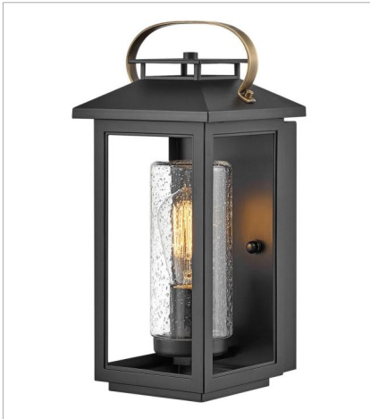
1160BK SMALL WALL MOUNT LANTERN 6.5" W, 14" H Socketed 1-10w Med. LED, 100w Equiv.