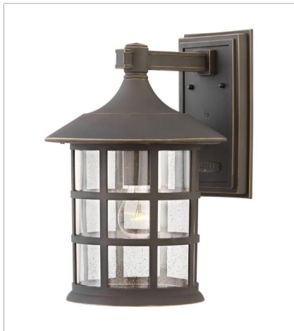
1865OZ LARGE WALL MOUNT LANTERN 10" W, 15.3" H Socketed 1-12w Med. LED, 100w Equiv.