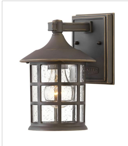
1860OZ SMALL WALL MOUNT LANTERN 6" W, 9.3" H Socketed 1-8w Med. LED, 75w Equiv.