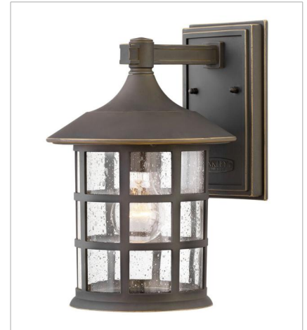
1864OZ MEDIUM WALL MOUNT LANTERN 8" W, 12.3" H Socketed 1-12w Med. LED, 100w Equiv.