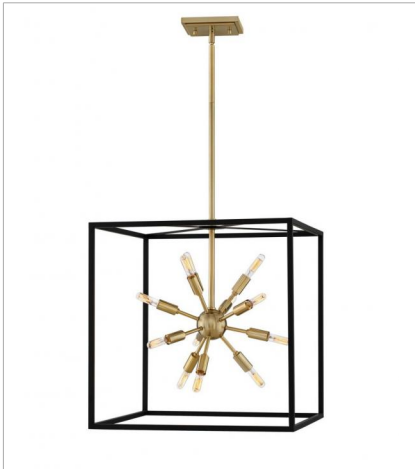
46314BLK MEDIUM OPEN FRAME PENDANT 20" W, 21" H Socket 12-60w Cand.