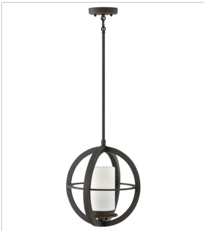
1012OZ LARGE HANGING LANTERN 14" W, 14.8" H LED Lamp, Socket 1-8w Med. LED, 100w Equiv. or 1-100w Med.