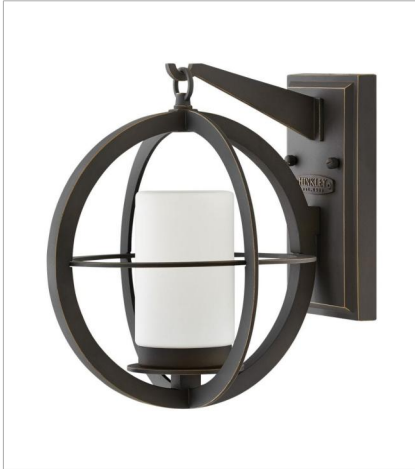
1010OZ SMALL WALL MOUNT LANTERN 10" W, 11.8" H LED Lamp, Socket 1-5w Cand. LED, 60w Equiv. or 1-60w Cand.

FINISH: Oil Rubbed Bronze GLASS: Etched Opal