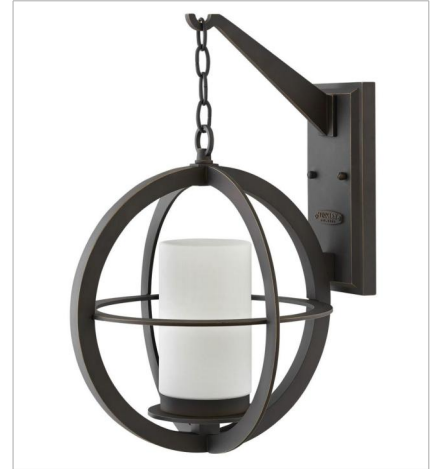
1015OZ LARGE WALL MOUNT LANTERN 13.8" W, 21" H Socket