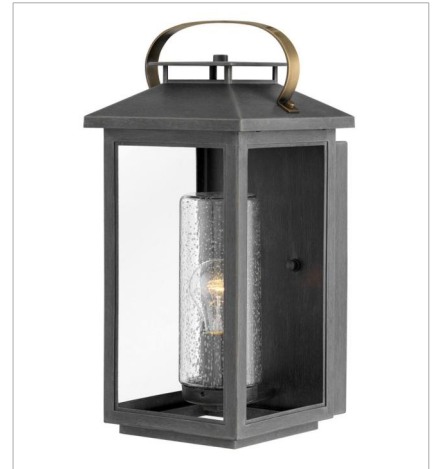
1164AH MEDIUM WALL MOUNT LANTERN 8.3" W, 17.5" H Socketed 1-10w Med. LED, 100w Equiv.