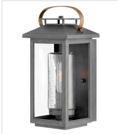
1160AH-LL MEDIUM WALL MOUNT LANTERN 6.5" W, 14" H Socketed 1-5w Med. LED *Included