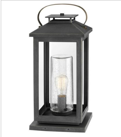
1167AH MEDIUM PIER MOUNT 9.5" W, 21.5" H Socketed 1-10w Med. LED, 100w Equiv.