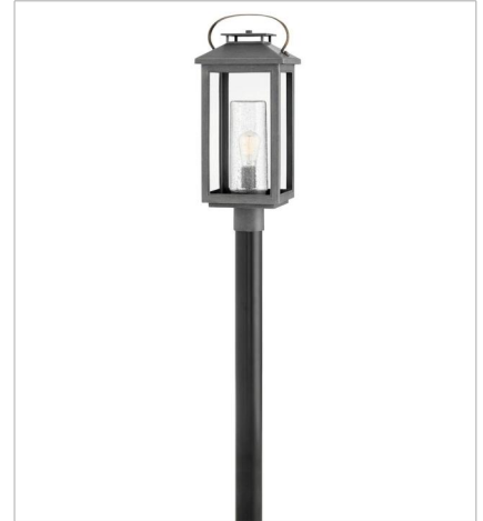
1161AH-LV LARGE POST TOP OR PIER MOUN... 9.5" W, 23" H Socketed 1-3.50w Med. LED *Included