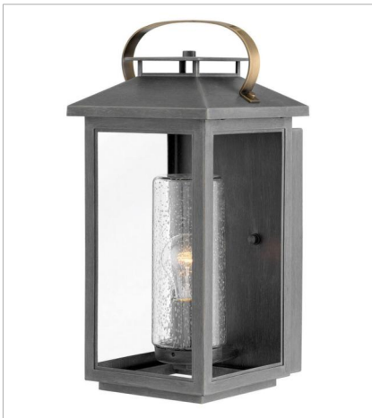
1164AH-LL MEDIUM WALL MOUNT LANTERN 8.3" W, 17.5" H Socketed 1-5w Med. LED *Included