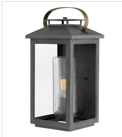
1165AH LARGE OUTDOOR WALL MOUNT LA... 9.5" W, 20.5" H Socketed 1-10w Med. LED, 100w Equiv.