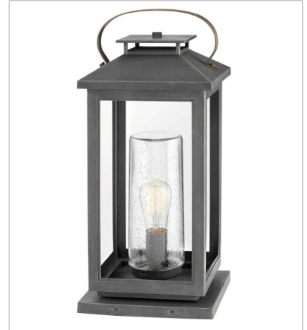
1167AH-LV LARGE PIER MOUNT LANTERN 12V 9.5" W, 21.5" H Socketed 1-3.50w Med. LED *Included