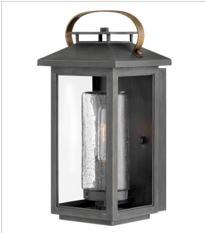
1160AH SMALL WALL MOUNT LANTERN 6.5" W, 14" H Socketed 1-10w Med. LED, 100w Equiv.