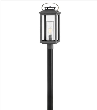
1161AH MEDIUM POST OR PIER MOUNT L... 9.5" W, 23" H Socketed 1-10w Med. LED, 100w Equiv.