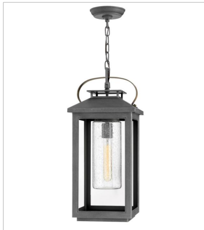
1162AH-LL LARGE HANGING LANTERN 9.5" W, 21.5" H Socketed 1-5w Med. LED *Included