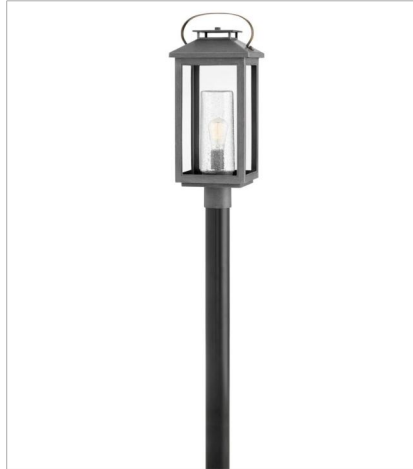
1161AH-LL LARGE POST TOP OR PIER MOUN... 9.5" W, 23" H Socketed 1-5w Med. LED *Included