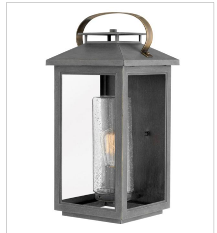
1165AH-LL MEDIUM WALL MOUNT LANTERN 9.5" W, 20.5" H Socketed 1-5w Med. LED *Included