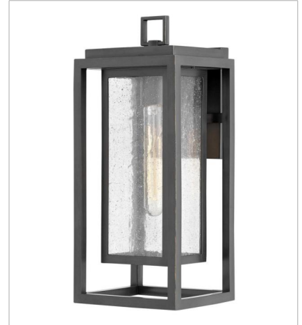
1004OZ MEDIUM WALL MOUNT LANTERN 7" W, 16" H Socketed 1-12w Med. LED, 100w Equiv.