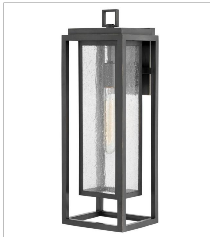
1005OZ LARGE OUTDOOR WALL MOUNT LA... 7" W, 20" H Socketed 1-12w Med. LED, 100w Equiv.