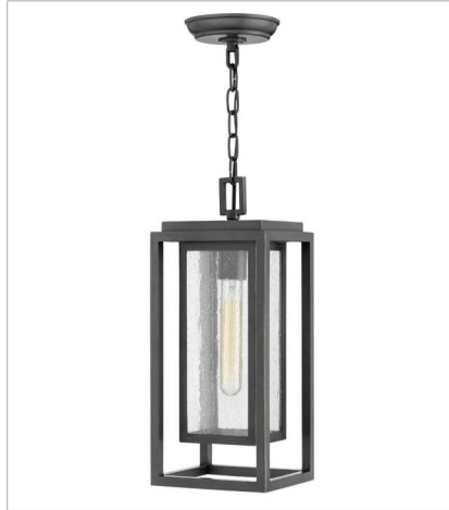
1002OZ MEDIUM HANGING LANTERN 7" W, 16.8" H Socketed 1-12w Med. LED, 100w Equiv.