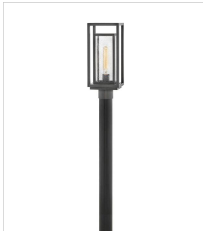
1001OZ-LV MEDIUM POST TOP OR PIER MOU... 7" W, 17" H Socketed 1-3.50w Med. LED *Included