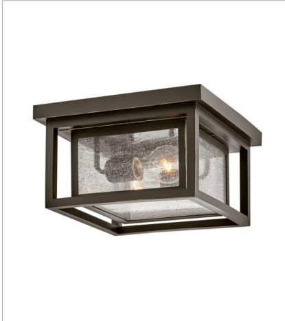
1003OZ MEDIUM FLUSH MOUNT 11" W, 6.5" H Socketed 2-8w Med. LED, 60w Equiv.

FINISH: Oil Rubbed Bronze GLASS: Clear Seedy