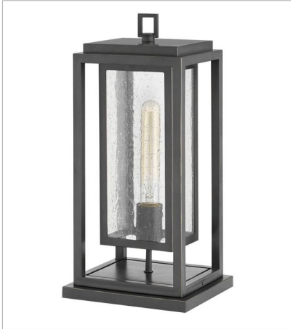
1007OZ-LV MEDIUM PIER MOUNT LANTERN 12V 7" W, 16.5" H Socketed 1-3.50w Med. LED *Included

FINISH: Oil Rubbed Bronze GLASS: Clear Seedy