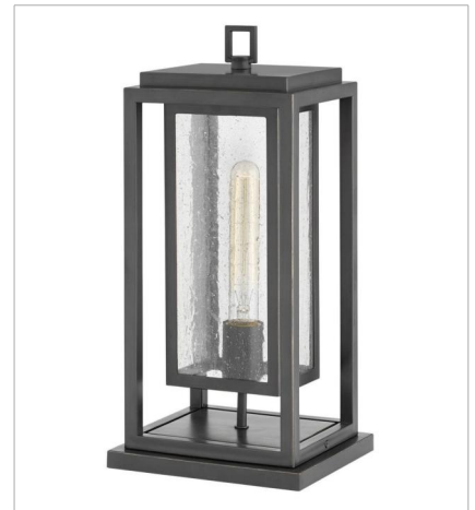
1007OZ MEDIUM PIER MOUNT 7" W, 16.5" H Socketed 1-12w Med. LED, 100w Equiv.