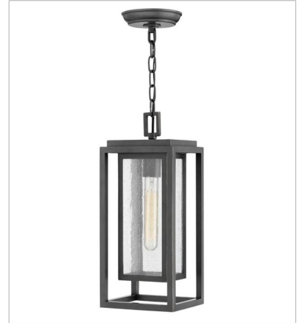
1002OZ-LV MEDIUM HANGING LANTERN 12V 7" W, 16.8" H Socketed 1-3.50w Med. LED *Included