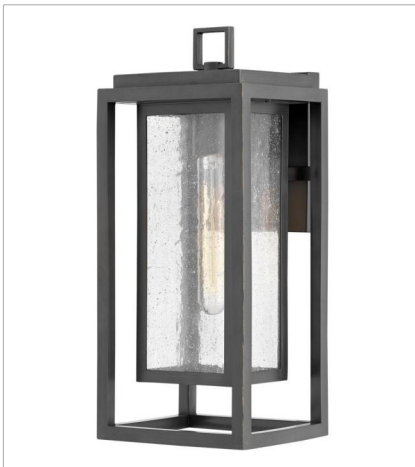
1004OZ-LV MEDIUM WALL MOUNT LANTERN 12V 7" W, 16" H Socketed 1-3.50w Med. LED *Included