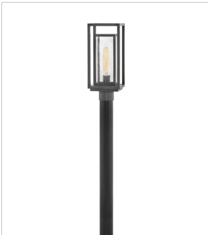
1001OZ MEDIUM POST OR PIER MOUNT L... 7" W, 17" H Socketed 1-12w Med. LED, 100w Equiv.