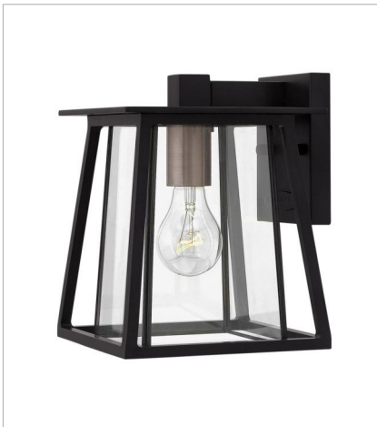
2106BK EXTRA SMALL WALL MOUNT LANTERN 7.3" W, 9.5" H Socketed 1-12w Med. LED, 100W Equiv.