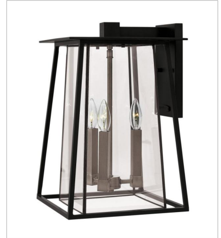
2105BK LARGE WALL MOUNT LANTERN 11.5" W, 17.5" H Socketed 3-5w Cand. LED, 60w Equiv.