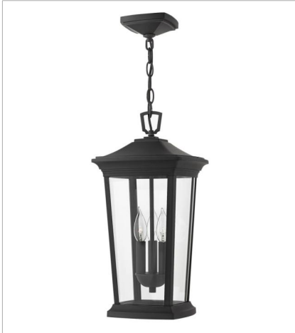
2362MB LARGE HANGING LANTERN 10" W, 19.3" H Socketed 3-5w Cand. LED, 60w Equiv.