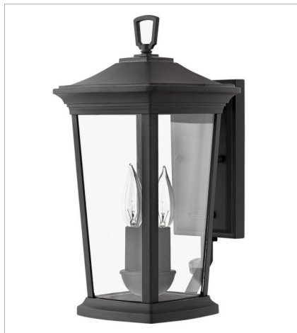
2360MB SMALL WALL MOUNT LANTERN 8" W, 15.5" H Socketed 2-5w Cand. LED, 60w Equiv.