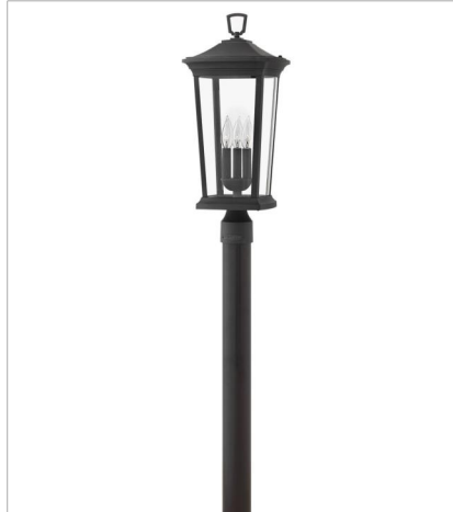
2361MB LARGE POST TOP OR PIER MOUN... 10" W, 22.8" H Socketed 3-5w Cand. LED, 60w Equiv.