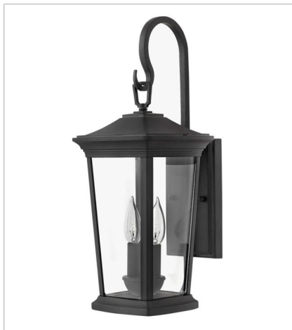
2364MB MEDIUM WALL MOUNT LANTERN 8" W, 20" H Socketed 2-5w Cand. LED, 60w Equiv.