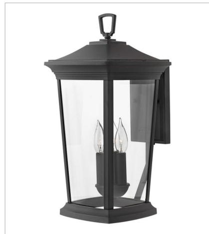
2365MB LARGE WALL MOUNT LANTERN 10" W, 19.3" H Socketed 3-5w Cand. LED, 60w Equiv.