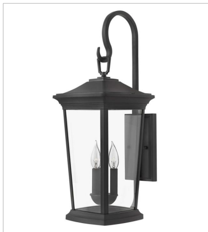
2366MB EXTRA LARGE WALL MOUNT LANTERN 10" W, 24.8" H Socketed 3-5w Cand. LED, 60w Equiv.