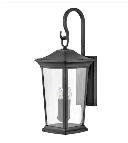
2369MB LARGE WALL MOUNT LANTERN 12" W, 30" H Socketed 3-5w Cand. LED, 60w Equiv.