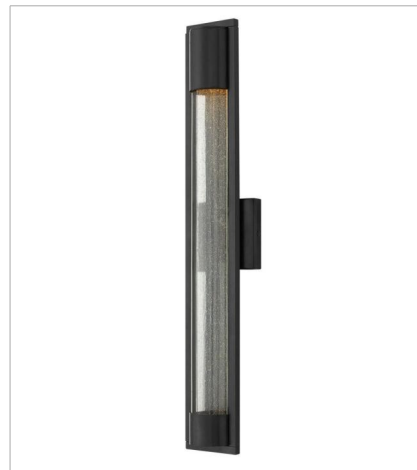
1225SK LARGE WALL MOUNT LANTERN 4.8" W, 28.5" H Socketed 1-7w GU10 LED, 50w Equiv.