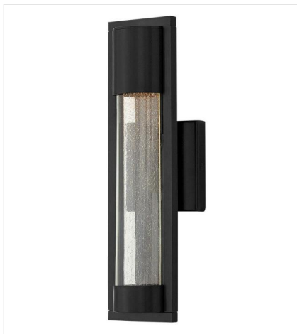
1220SK SMALL WALL MOUNT LANTERN 4.8" W, 15.5" H Socketed 1-7w GU10 LED, 50w Equiv.

FINISH: Satin Black GLASS: Clear Acrylic Outside Cylinder & Seedy Glass Inside Panel