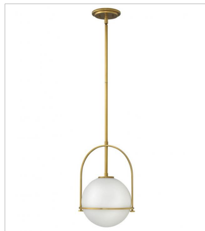
3407HB MEDIUM PENDANT 11.5" W, 17" H Socket 1-100w Med.