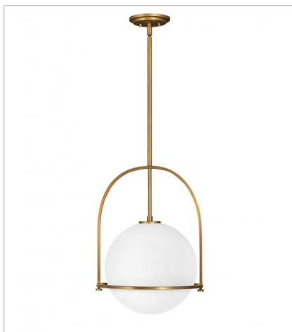
3405HB LARGE PENDANT 15.5" W, 23" H Socket 1-100w Med.