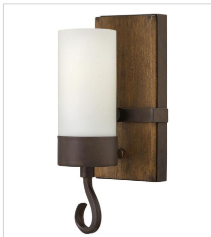
FR48430IRN SINGLE LIGHT SCONCE 4.5" W, 11.5" H LED Lamp, Socket 1-12w Med. LED, 100w Equiv. or 1-100w Med.