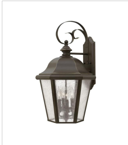
16750Z-LL LARGE WALL MOUNT LANTERN 15" W, 25.5" H Socketed 4-2w Cand. LED *Included