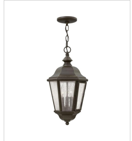
16720Z MEDIUM HANGING LANTERN 10" W, 19.5" H Socketed 3-5w Cand. LED, 40w Equiv.