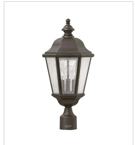
16710Z-LL MEDIUM POST MOUNT LANTERN 10" W, 21.3" H Socketed 3-2w Cand. LED *Included