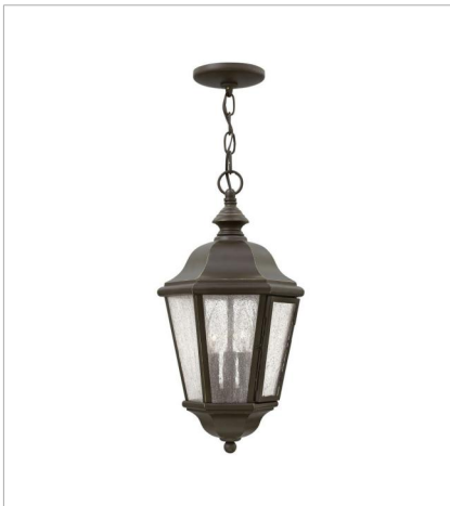
16720Z-LL MEDIUM HANGING LANTERN 10" W, 19.5" H Socketed 3-2w Cand. LED *Included