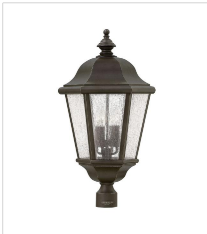
1677OZ-LL EXTRA LARGE POST MOUNT LANTERN 15" W, 27.8" H Socketed 4-2w Cand. LED *Included