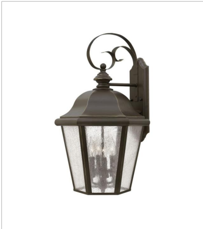
16750Z EXTRA LARGE WALL MOUNT LANTERN 15" W, 25.5" H Socketed 4-5w Cand. LED, 40w Equiv.