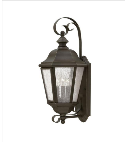
16700Z-LL MEDIUM WALL MOUNT LANTERN 10" W, 21" H Socketed 3-2w Cand. LED *Included