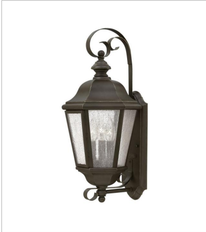
16700Z MEDIUM WALL MOUNT LANTERN 10" W, 21" H Socketed 3-5w Cand. LED, 40w Equiv.

FINISH: Oil Rubbed Bronze GLASS: Clear Seedy