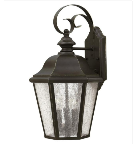
16760Z MEDIUM WALL MOUNT LANTERN 10" W, 18" H Socketed 3-5w Cand. LED, 40w Equiv.