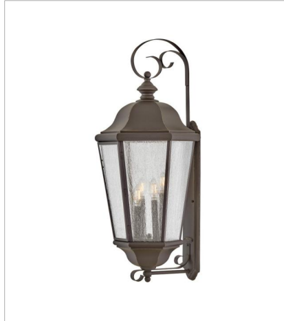
16790Z GRANDE WALL MOUNT LANTERN 15" W, 34.8" H Socketed 4-5w Cand. LED, 60w Equiv.