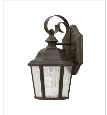
16740Z SMALL WALL MOUNT LANTERN 6.5" W, 11.5" H Socketed 1-10w Med. LED, 60w Equiv.