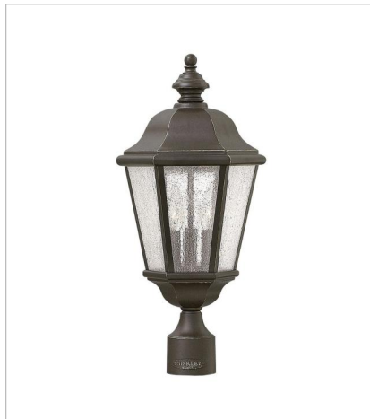
16710Z MEDIUM POST MOUNT LANTERN 10" W, 21.3" H Socketed 3-5w Cand. LED, 40w Equiv.