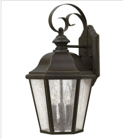
16760Z-LL MEDIUM WALL MOUNT LANTERN 10" W, 18" H Socketed 3-2w Cand. LED *Included

FINISH: Oil Rubbed Bronze GLASS: Clear Seedy