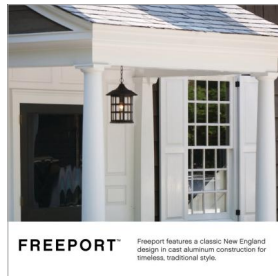
FREEPORT™ Freeport features a classic New England design in cast aluminum construction for timeless, traditional style.